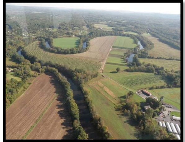
Riparian forest buffers are a best management practice used to reduce water pollution

A Nine Element Watershed Management (9E) Plan is a type of clean water plan that details a community's water quality concerns and a strategy to address these concerns. 9E Plans are developed by people who live and work within the watershed with support from local and state agencies. The nine minimum elements are intended to ensure that the contributing causes and sources of nonpoint source pollution are identified, that key stakeholders are involved in the planning process, and that restoration and protection strategies are identified that will address the water quality concerns.