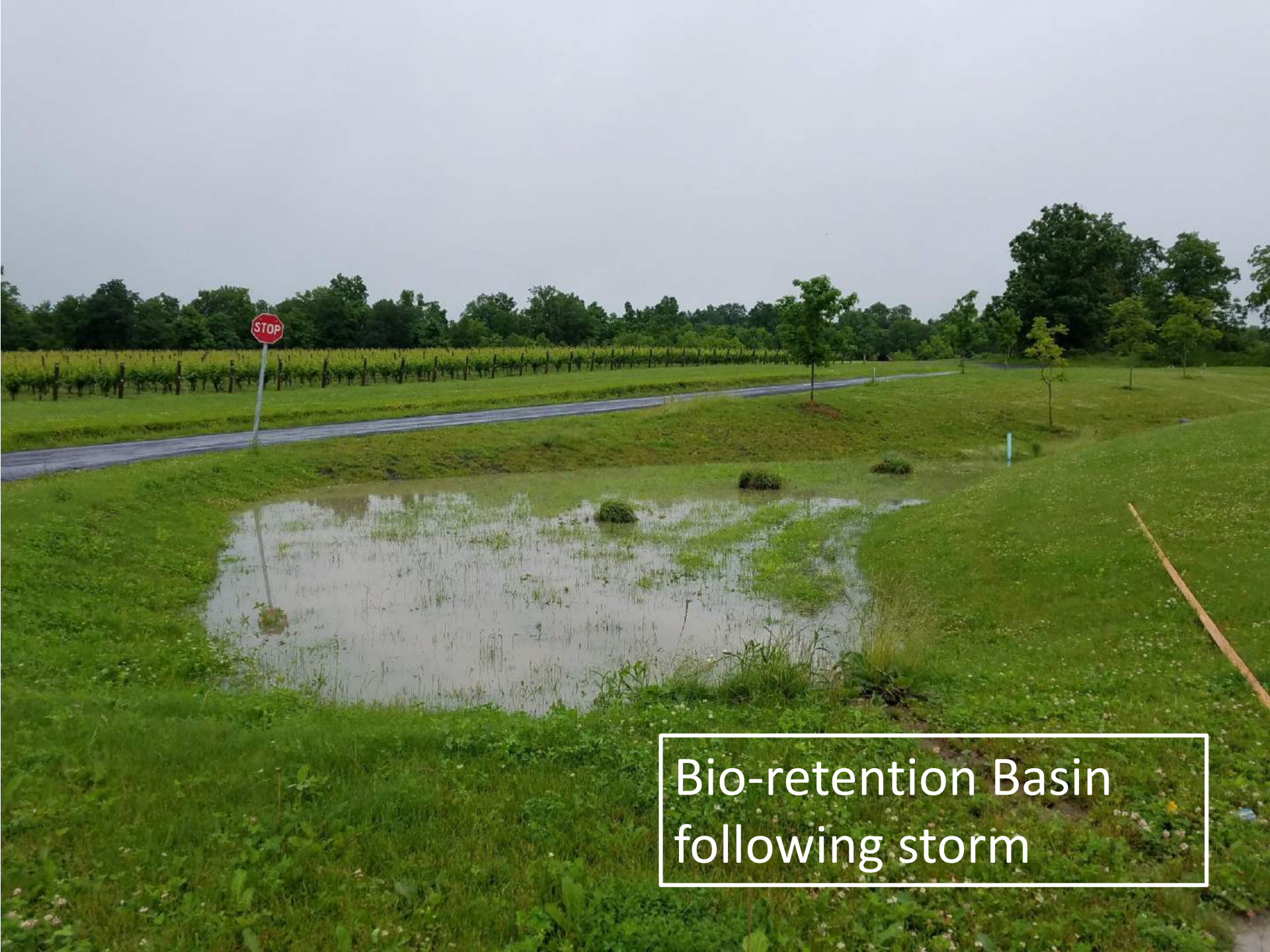
Bio-retention Basin following storm